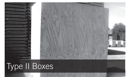
Type II Boxes